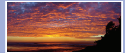
SUNSET AT YACHATS BAY